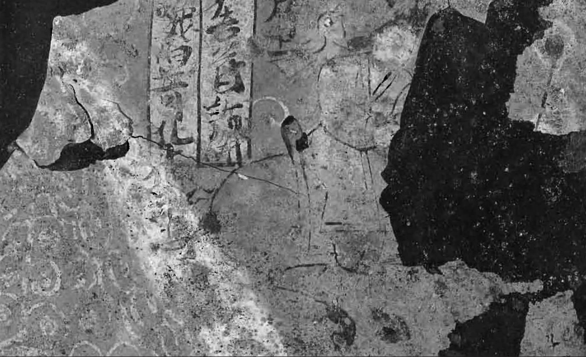
Figure #4: Bo Qi as the vengeful bird riding on his father's shoulder. Painting on the lacquered Sima Jinlong screen. Datong, Shanxi Province. Northern Wei dynasty, late 5th century.

in northern tombs from the fifth through the eighth centuries (see figure #4). 49 The tale also made an impression on the writer and official Yan Zhitui (530-590) who stated, "Jifu was a wise father; Bo Qi was a filial son. A wise father guides his filial son; their harmony gains completion through their heavenly nature. Only afterwards was the second wife able to put distance between them." 50 Importantly, Yan Zhitui views the harmony that prevails between father and son as coming from their innate nature. It is a natural state of being.